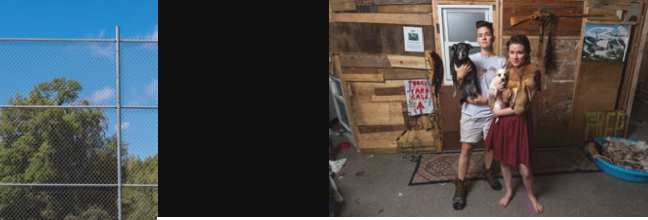
Beth Plakidas, Go Home, 2015