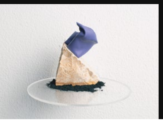
Katina Bitsicas, Vitreous, 2015