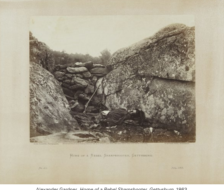
Alexander Gardner, Home of a Rebel Sharpshooter, Gettysburg, 1863