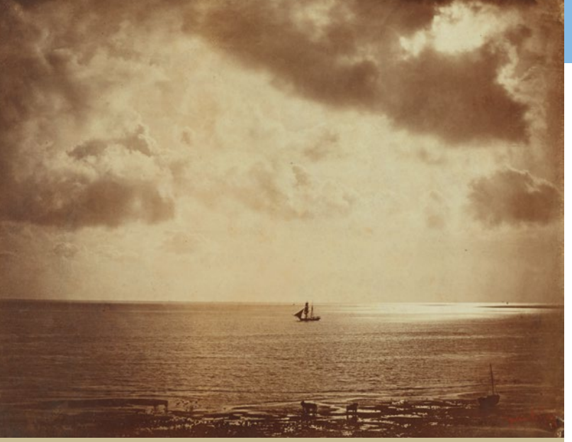
Gustave Le Gray, Seascape: Brig Upon the Water, 1860.